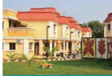
Shanti Shristi, Santiniketan