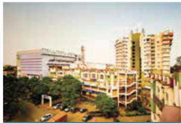
Durgapur City Centre, Durgapur