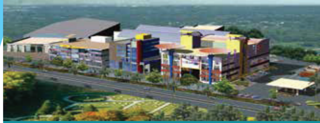
Raniganj Square - The Highway Hub, Raniganj