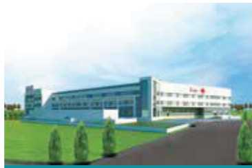
Suasth Hospital, Navi Mumbai