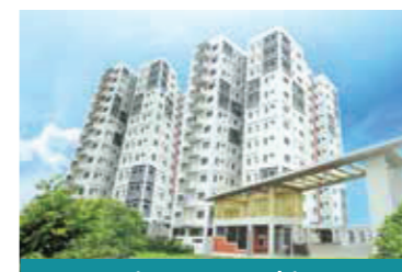
The Arena, Haldia International Sports City, Haldia