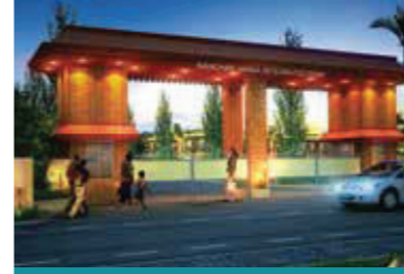
Kanchan Janga Integrated Park, Siliguri