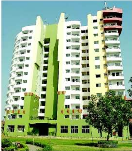
The tallest residential tower in Bengal beyond Kolkata.