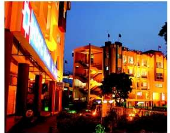
The commercial complex took big brands beyond Kolkata.