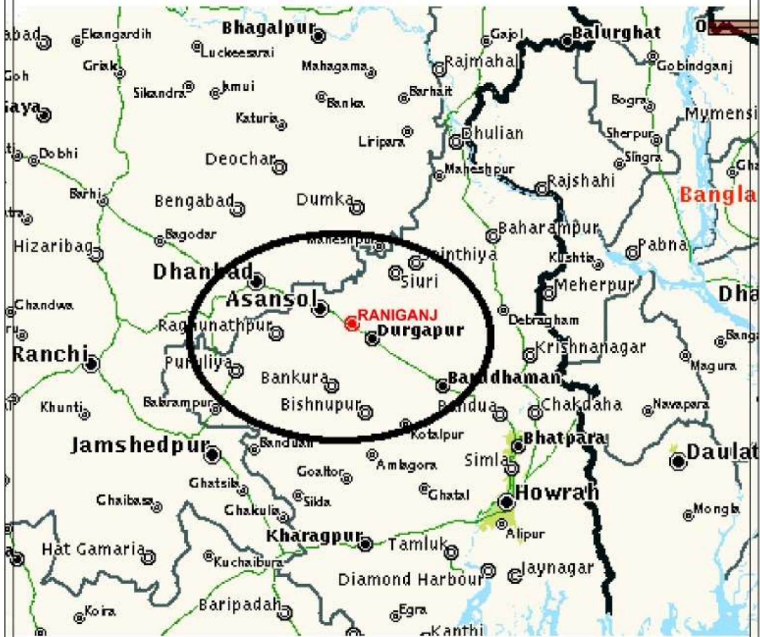
CATCHMENT AREA - SOUTH BENGAL HINTERLAND