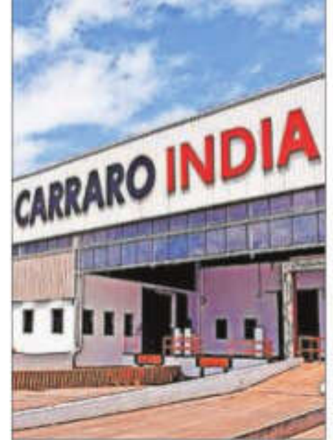
Carraro India operates two manufacturing plants in Pune...

CARRARO INDIA, MANUFACTURER of transmission systems for off-highway vehicles and other agricultural and construction equipment, on Saturday filed draft papers with Securities and Exchange Board of India (Sebi) for its ₹1,812-crore initial public offering (IPO).