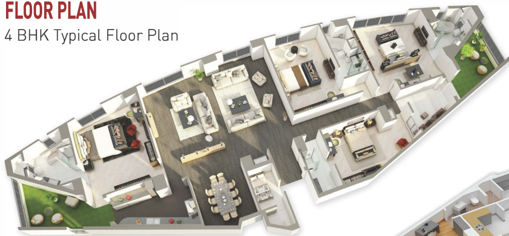
4 BHK Typical Floor Plan