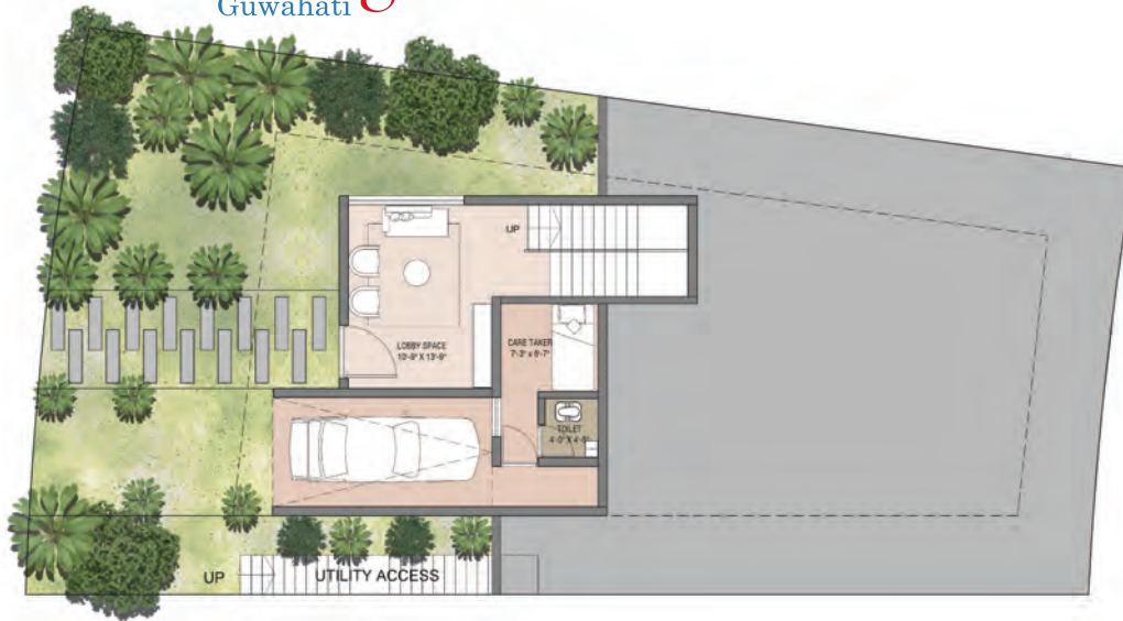
UP HILL- LEV 00 - 516 SFT