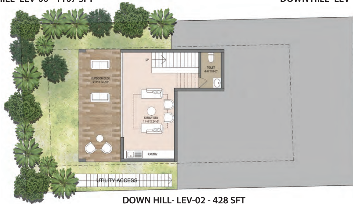
DOWN HILL- LEV-02 - 428 SFT