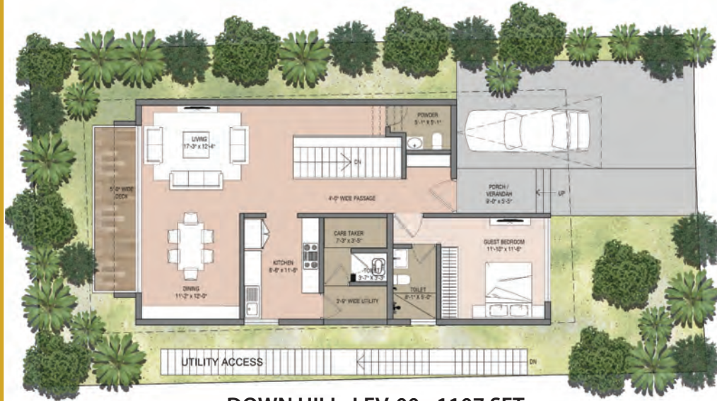
DOWN HILL- LEV-00 - 1107 SFT