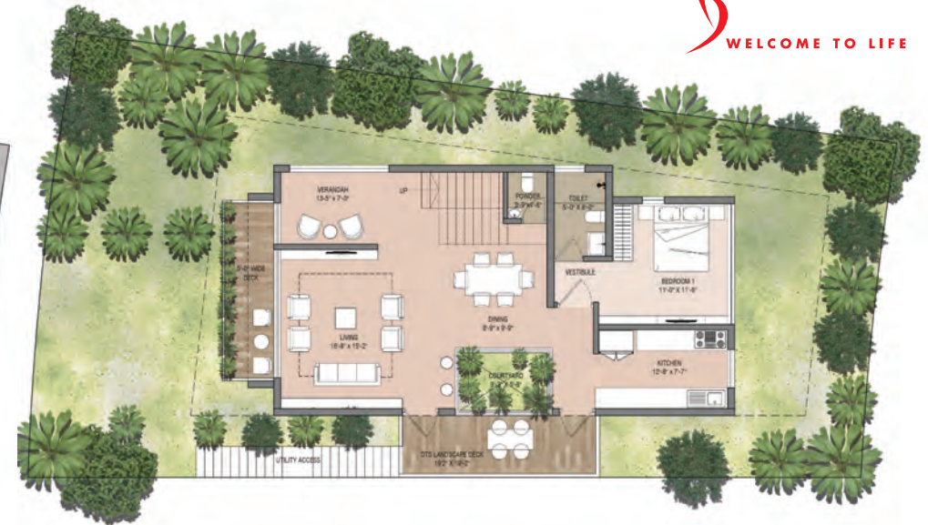
UP HILL- LEV 01 - 1046 SFT