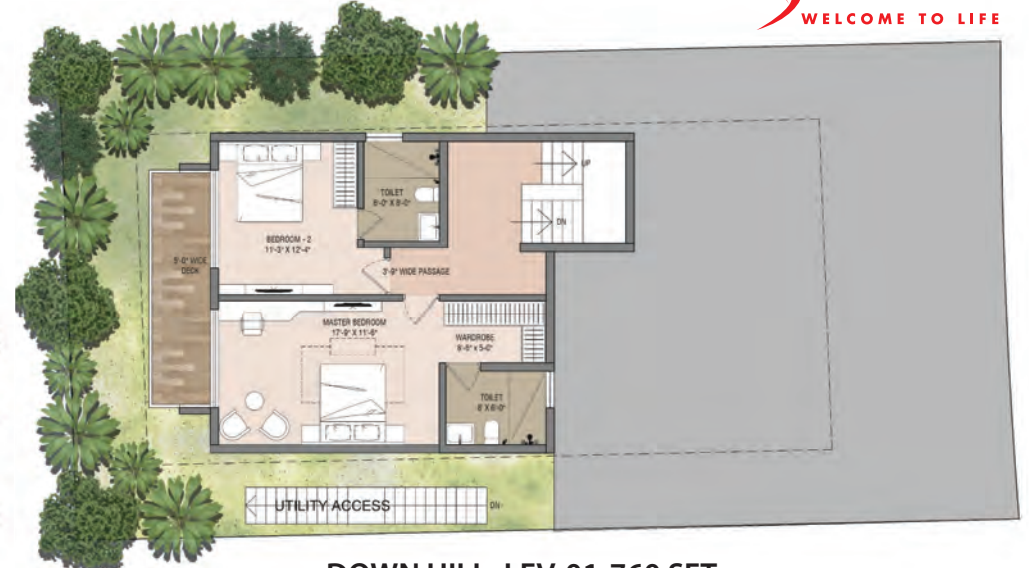
DOWN HILL- LEV-01-760 SFT