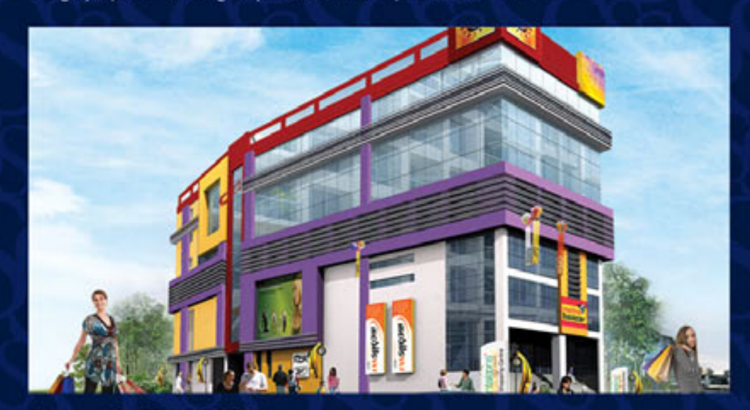
Aitorna, AGARTALA, TRIPURA