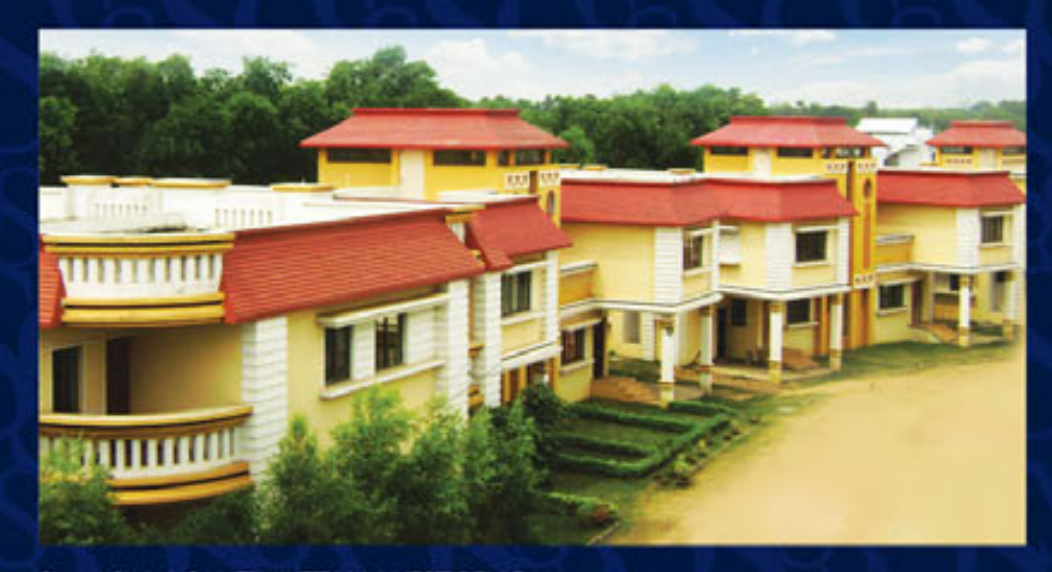
Shanti Shristi, SANTINIKETAN, WEST BENGAL