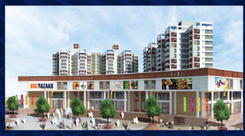
Krishnagar Sentrum, KRISHNANAGAR, WEST BENGAL