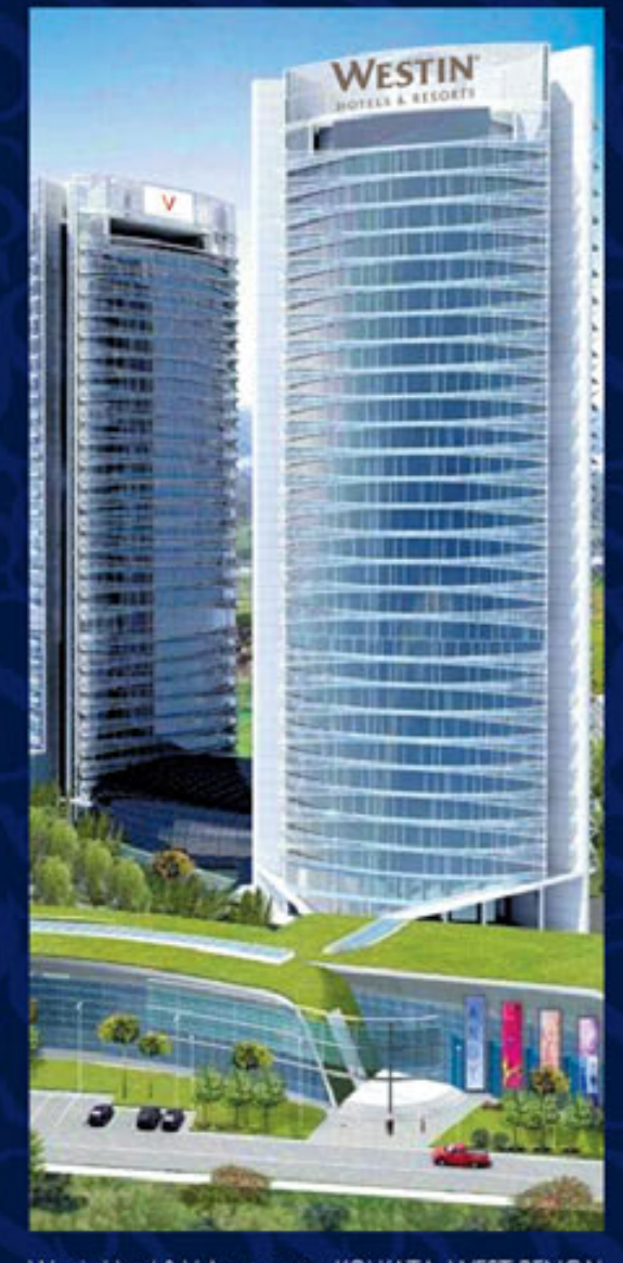
Westin Hotel & V Apartments - KOLKATA, WEST BENGAL The Arena, HALDIA, WEST BENGAL