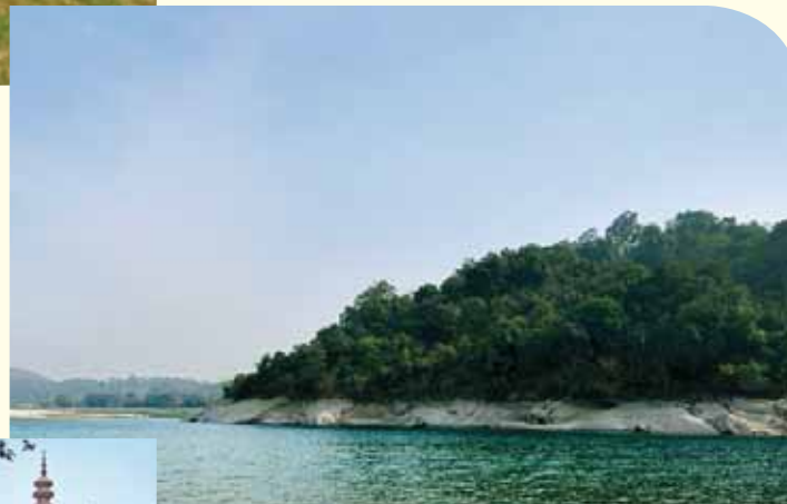
Actual site image