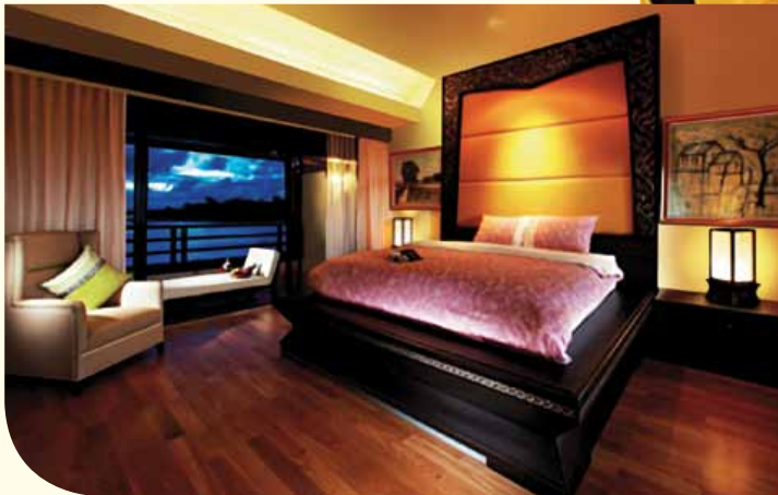
Hotel room view