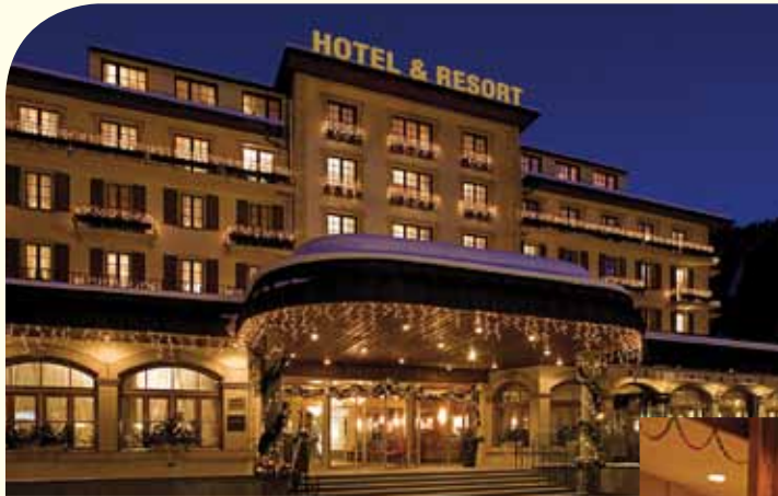
Hotel & Resort