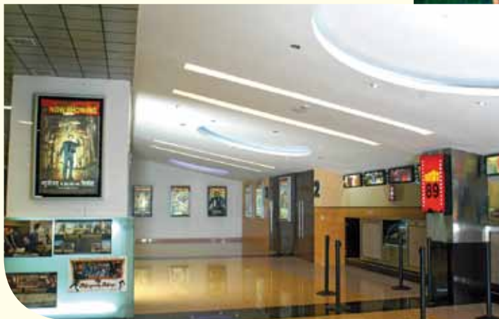
Multiplex and other Entertainment Zones within Shristinagar