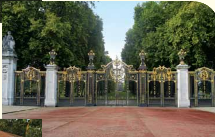
24x7 Complete Security